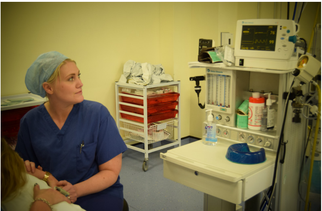
FPM stock image

The main strength of this busy pain service is the integration between different treatment modalities, with weekly multidisciplinary team meetings, and a practical hand-in-hand approach to the management of complex patients.