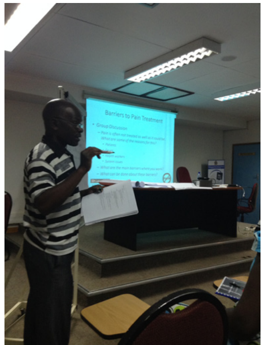
Teaching by local trained staff.

Much of healthcare in Malawi is provided by non-medical staff, and participants were predominantly nurses and clinical officers with a small number of doctors. Courses have been run on three occasions in Malawi (2014-2016), with local staff taking on an increasing role with each successive course. The second course was taught by a combination of local instructors trained on the first course, and visiting instructors from the UK. The third course was the most interesting with regard to development of the EPM project. Instructors were entirely locally trained (a UK anaesthetic registrar gave some administrative support).